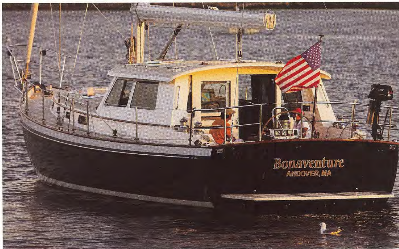
A true motorsailer, the Bruckmann 50 has a huge saloon with great 360-degree views and an ample cockpit