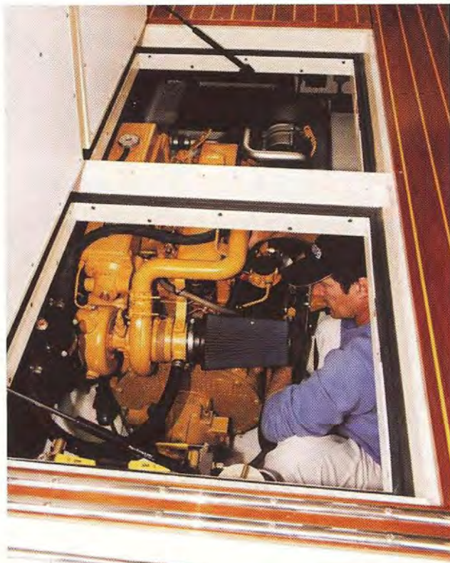
The engine room lies under the saloon floor (above). Under power alone, the boat can cruise transatlantic

Betty has done a lot of fairly serious research on the prop for Bonaventure . He has tried fixed, feathering and folding props, discovering the benefits of each and has settled on a four-blade Varifold prop. "It's the smoothest, quietest prop I've used," he says.