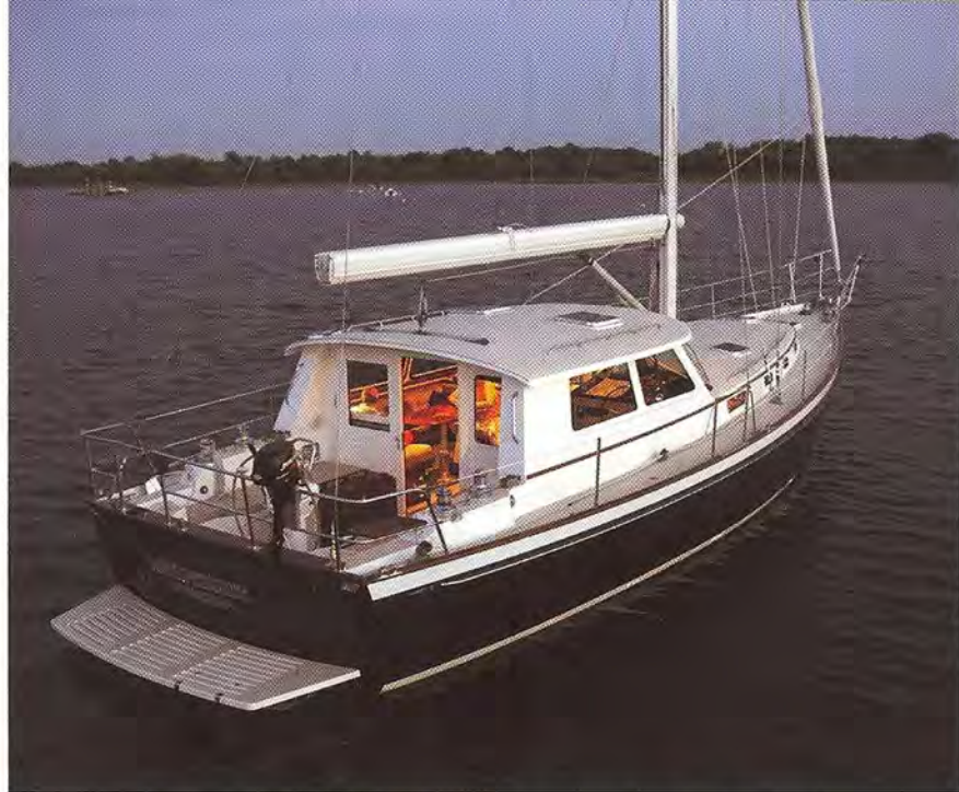
The raised doghouse and cockpit are on one level while the galley and cabins are down two steps going forward

From the large, comfortable cockpit, laid out like any well conceived offshore sailboat, the saloon's sole is on the same level as the cockpit's. A large sliding door opens up wide enough to pass. All the boat's major gear, from tanks to genset to galley furniture to the engine, was all installed after the boat was built. This is a strategy that might slow things down in the yard, but one that will be appreciated in later years. We have visited numerous production boatyards and watched the entire boat assembled before the deck was dropped on. Even if the drawings assure one that the engine can be removed, there is nothing to